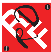
ROAD DANGER REDUCTION FORUM